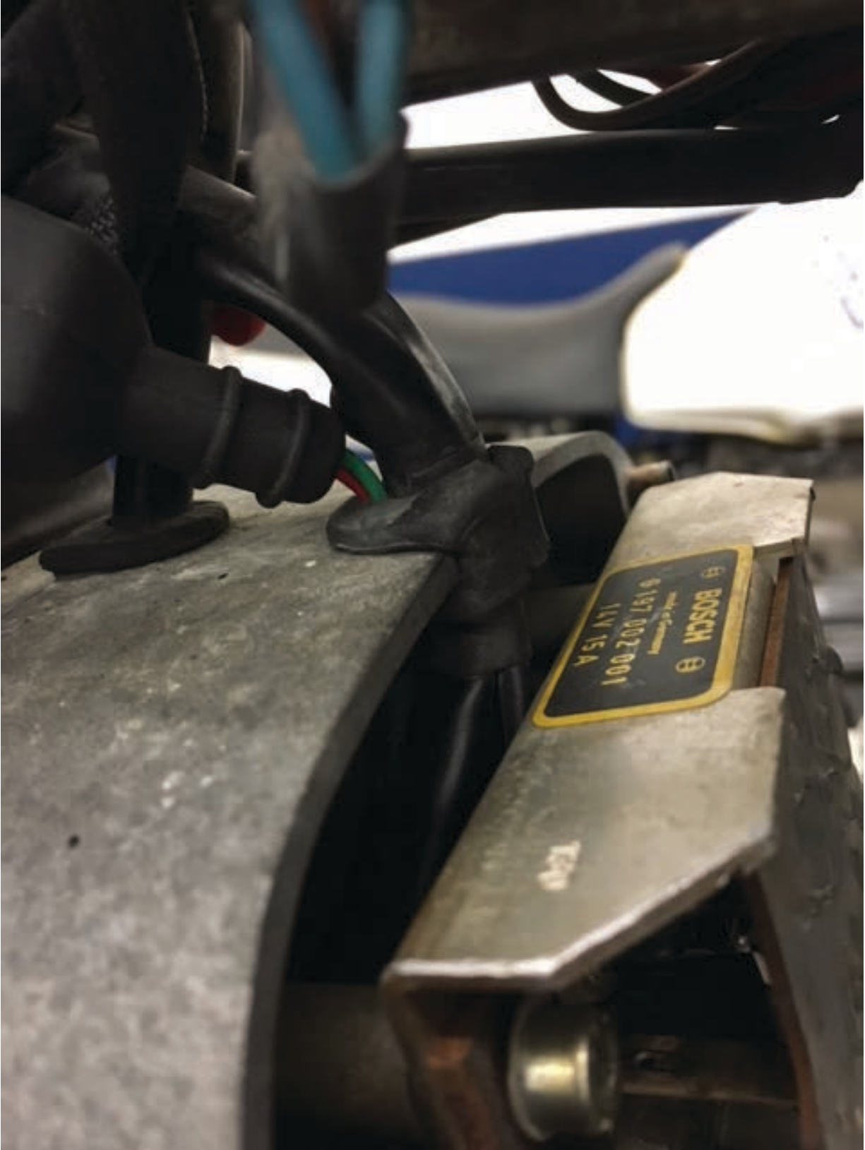
7) Install harness, plug it all in, cable tire to frame